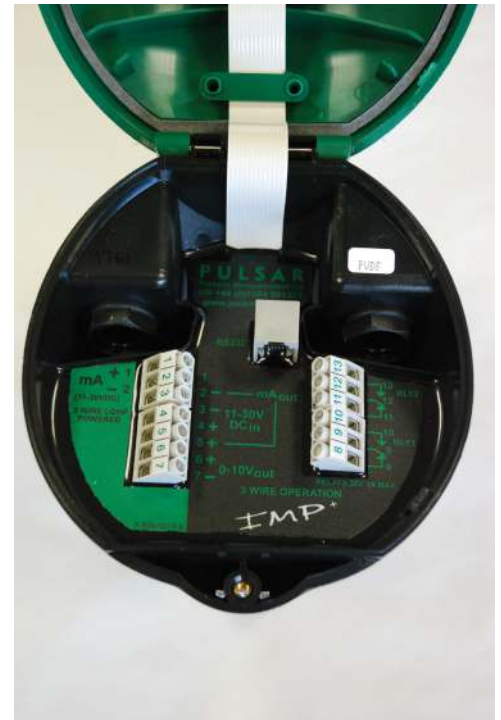
Inside of an IMP+