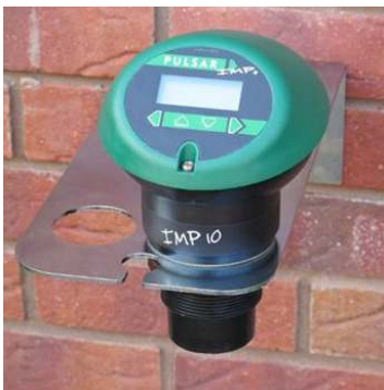
Optional IMP mounting bracket.