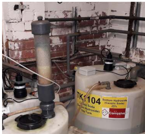
dBR8's reading through the plastic lid of a chemical tank.