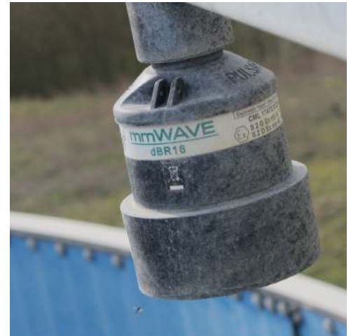
dBR16 on a foamy aeration tank.

Radar measurement will produce more stable results than ultrasonic sensors with limited acoustic power on foamy applications. This is because the foam interrupts the signal of the ultrasonic transducer; you can still get around this issue with ultrasonic measurement by using a sensor with high acoustic power. However, one thing that both technologies have in common is that it is virtually impossible for them to see through the foam to the liquid surface.